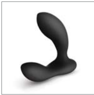
BRUNO™ Black 7350075 022456