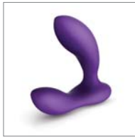
BRUNO™ Purple 7350075 022463

Product images available in our Retailer System ( www.lelo.com/retailer ).